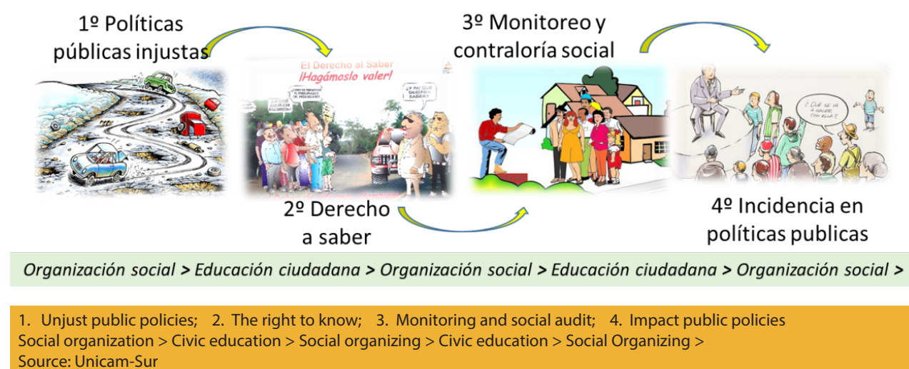
Figure 1. Stages of the process of citizen intervention into public matters.

Figure 1 represents a pathway of citizen action for transparency and accountability in local governments. In the case of Guerrero, these processes have an impact at specific moments but tend to be short-lived, occurring at different times and places, and sometimes with the advocacy support of Unicam-Sur activist groups. Citizen awakening that influences state and municipal politics unfolds in participatory waves related to the cycles of government administrations.