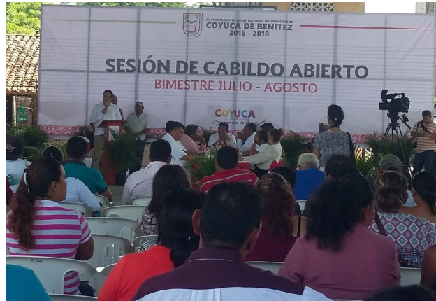
First session of the public, itinerant town council meeting in August of 2017, in the locality of de Bajos del Ejido, Coyuca de Benítez, which was created through the efforts of the Union of Communities.

Turning these concepts into systematic processes sustained over the long-term requires the organization and action of citizen groups and networks which, day after day, so they can develop citizens' capacities to: produce their own information outlets, position themselves in the mass media, design and implement outreach campaigns, build alliances with social actors from other regions, and engage in lobbying and diplomacy with public officials.