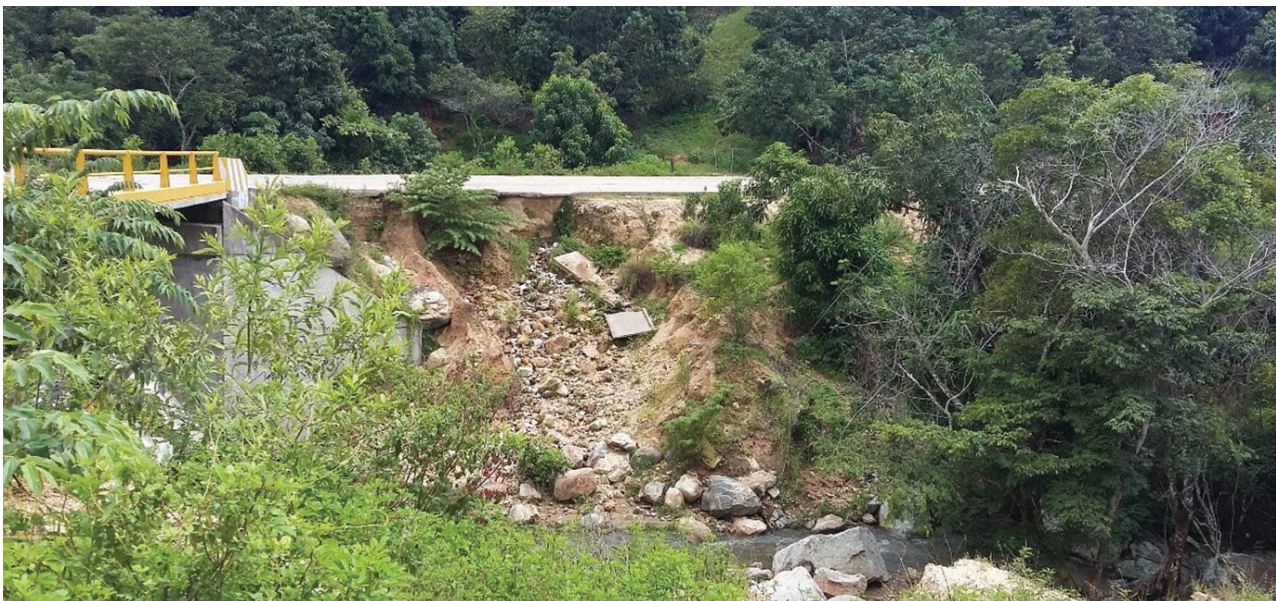
Collapse of a bridge retaining wall in the community of Plantanillo, Coyuca de Benítez; an example of a poor quality public works project.

quality; that despite the allocation of a sufficient budget to health centers, they don't have medicines or physicians; that the municipal governments break the law when they do not hold public town hall meetings; and that the information that government agencies are supposed to publish is not published. Behind these findings is a process of recognizing (and learning) citizen rights, taking on the problems they face, seeking solutions through dialogue, requesting information from the authorities, comparing the technical record with how the project is implemented, and organizing themselves to follow up with the government, to address shared needs. By keeping tabs on public activities related to their interests, citizens are able to develop norms for how public affairs should be conducted. Unfortunately, these experiences do not necessarily continue over time, nor become widespread, nor succeed in taking the form of permanent structures for citizen participation. This continues to pose a challenge to those who promote these initiatives.