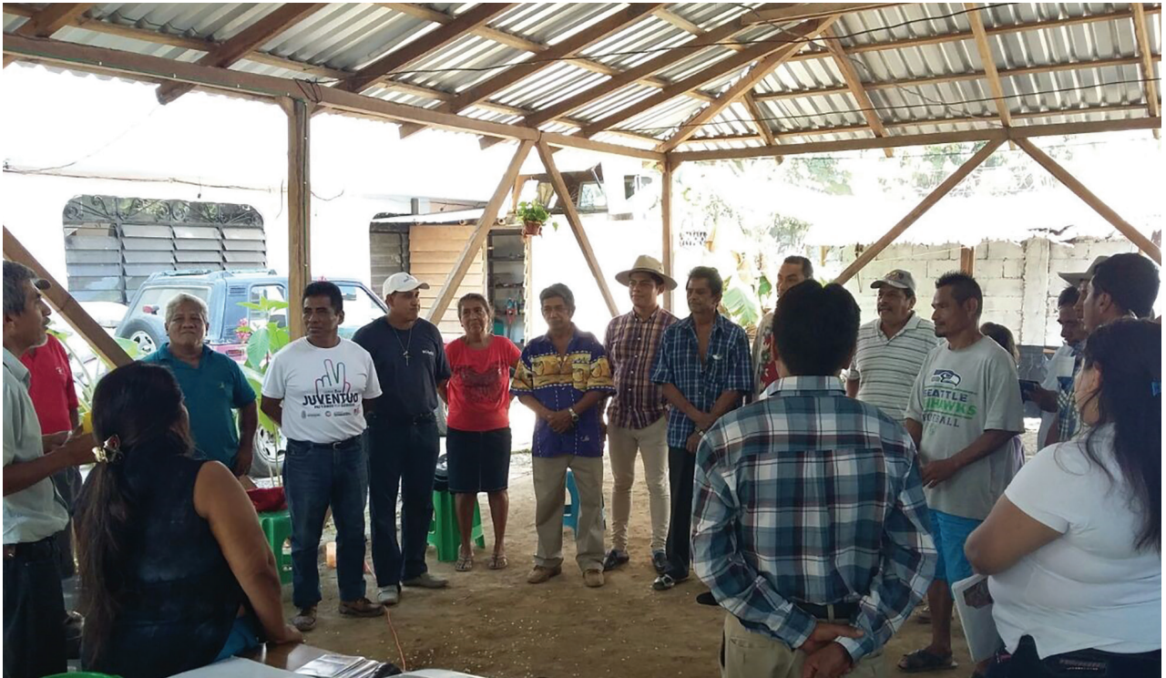
Beginning a social accountability workshop with community representatives from Coyuca de Benítez and Atoyac de Álvarez.