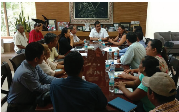
Municipal activists requesting the officials of the Town Hall of Acapulco that the town council meetings be public, itinerant and that they give voice to the people.

The active citizenry, which has been chipping away for decades, cultivating this hope for democratization, now faces the challenge of weaving together the public information and civic education, making adequate use of the laws on transparency and social participation, integrating citizen oversight mechanisms, and activating the institutional mechanisms for social participation.